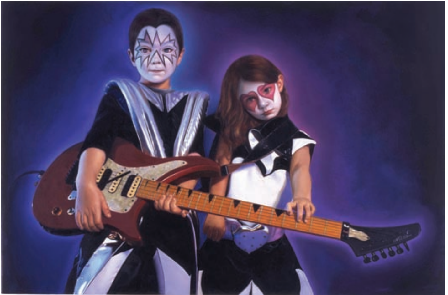
Ron English, Kursed Kids , 2008, oil on canvas, 24 x 36 in., Detail on the following page