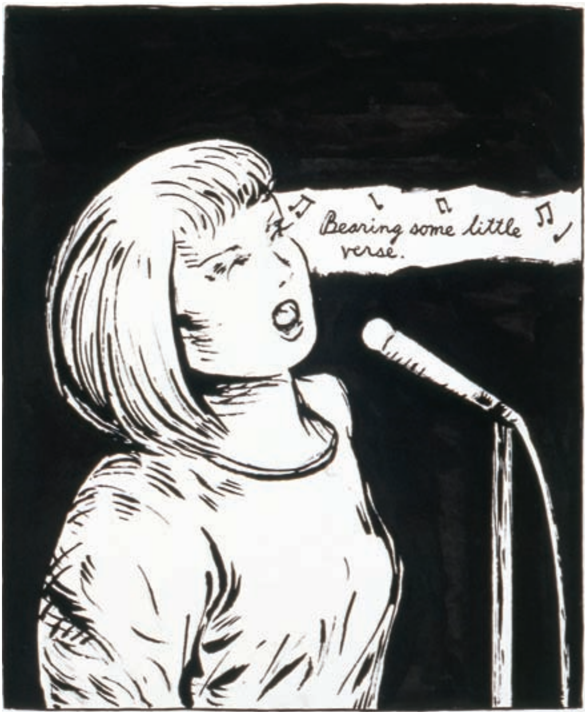
Raymond Pettibon, No Title (Bearing Some Little) , 1990, pen and ink on paper, 11.5 x 9 in.